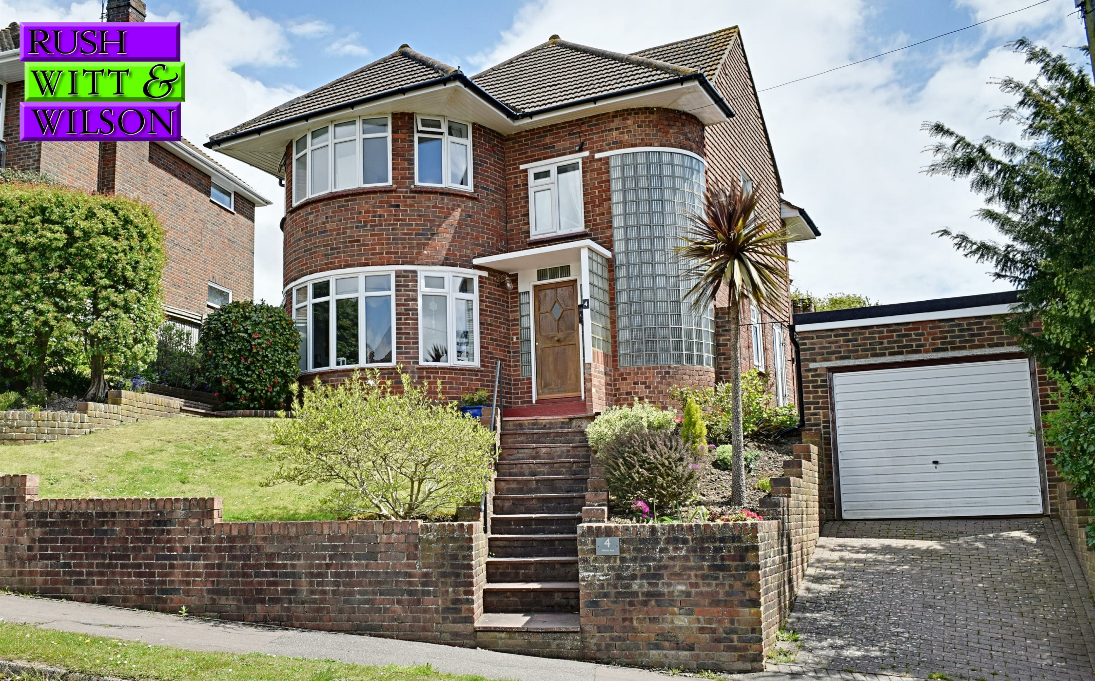
4 Millfield Rise, Bexhill-On-Sea, East Sussex TN40 1QY £550,000